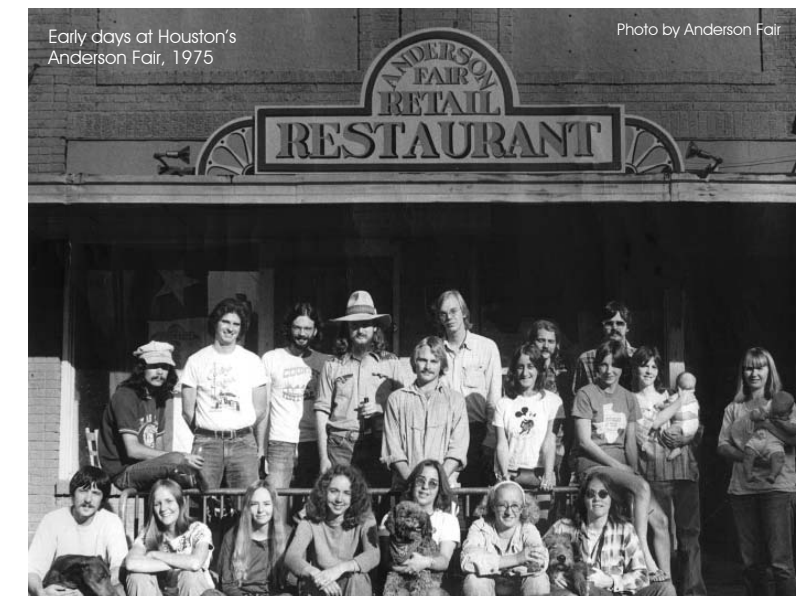
Early days at Houston's Anderson Fair, 1975

During performances, all cell phones must be turned off, and no talking is allowed.